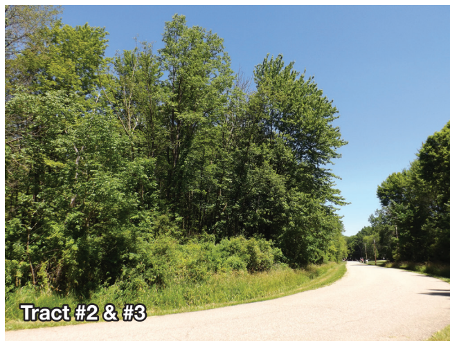
Tract #2 & #3

Information is believed to be accurate but not guaranteed.