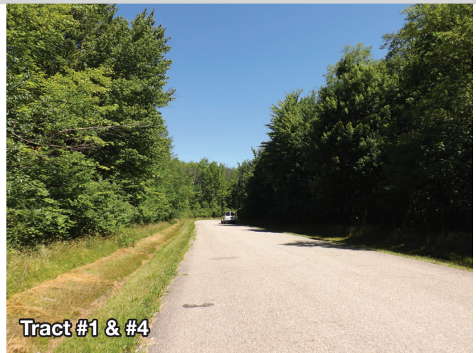
Tract #1 & #4